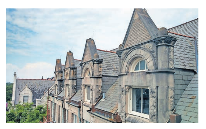
Tulane University's Richardson Memorial Hall was built in 1908.

But Richardson's main contributions to New Orleans came vicariously, as his nationwide popularity got reimported locally. Architects influenced by his work began designing similar structures for local clients.