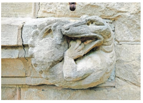
Gargoyles and grotesques typical of medieval architecture appear in some of Richardson Romanesque designs. This one is on Tilton Hall at Tulane.