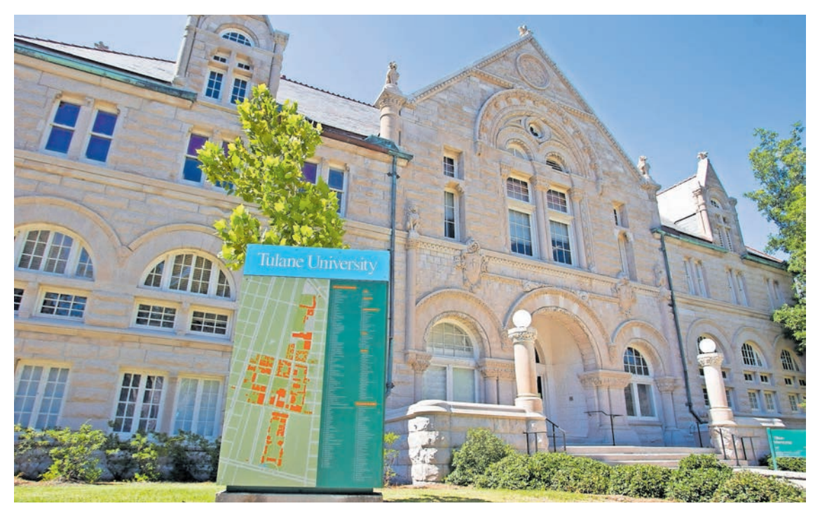
Tilton Memorial Hall, completed in 1902, was originally Tulane University's Library.